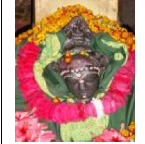
Ugratara mata – a closure view