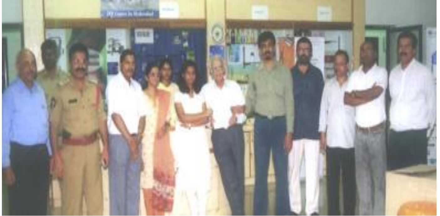
List handed over to the representative of CNN-IBN in presence of Head of SANATHNAGAR Police station.