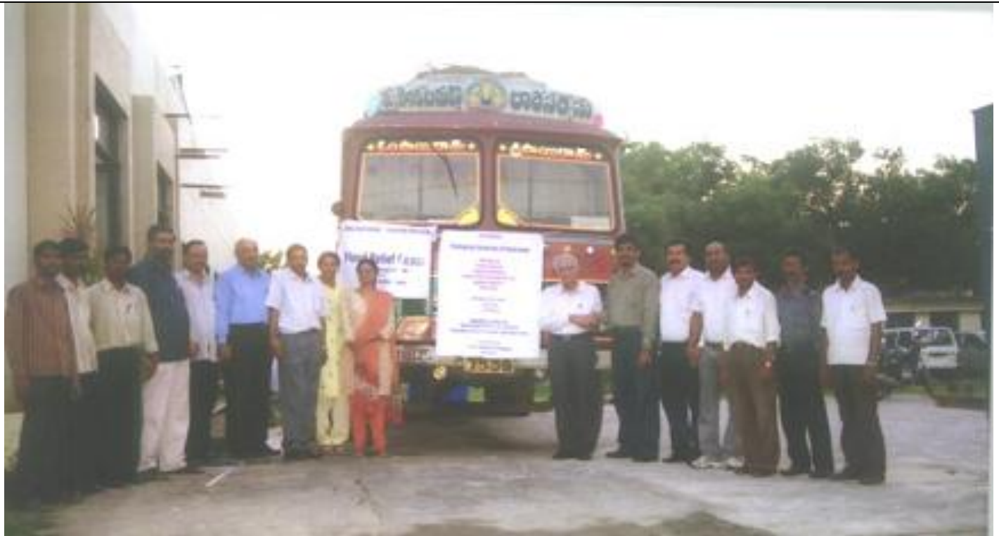
Truck with Flood relief Goods

Relief Goods sent under the banner of PACKAGING INDUSTRIES OF HYDERABAD